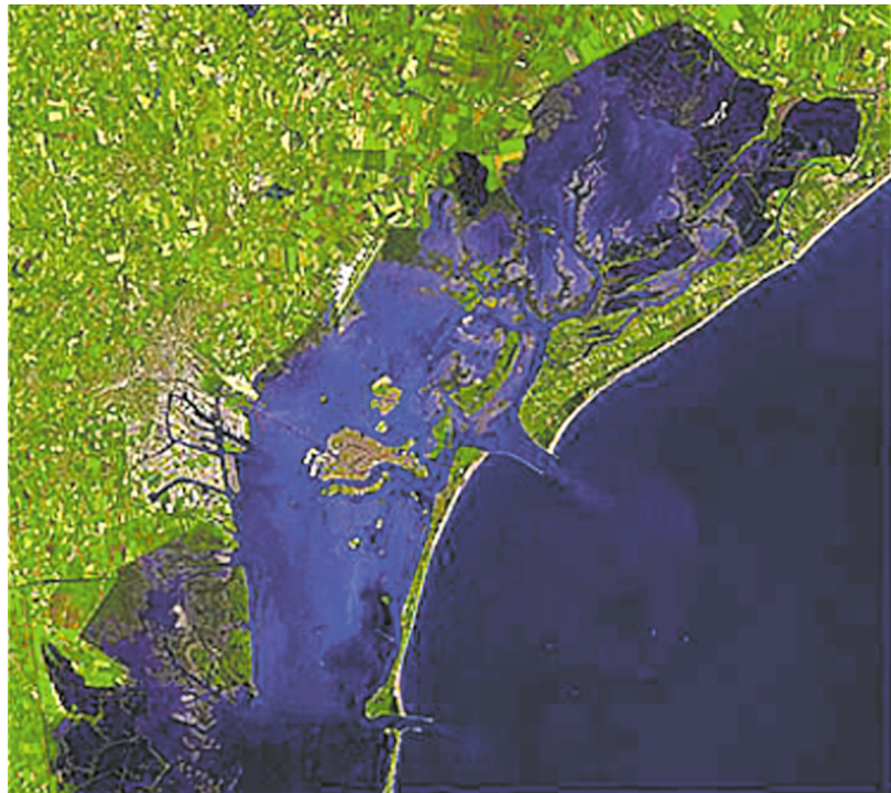
Remote Sensing Tutorial/GSFC/NASA

And again, where do they [the IPCC] get it from? They get it from their inspiration, their hopes, their computer models, but not from observation, which is terrible.